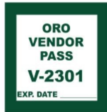
Sample 2 Vendors

Owner stickers as in sample 1 are to be displayed by all owners of ORO on the windshield of the following vehicles: Automobiles, trucks, vans, golf carts, motorcycles, mopeds, scooters. Stickers will be renewed every 2 years starting in July 2023.