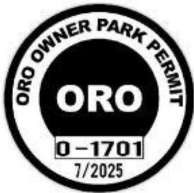
Sample 1 - Owners